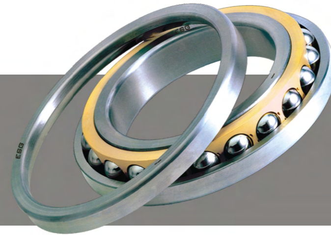
四点接触球轴承 Four-point Contact Ball Bearings