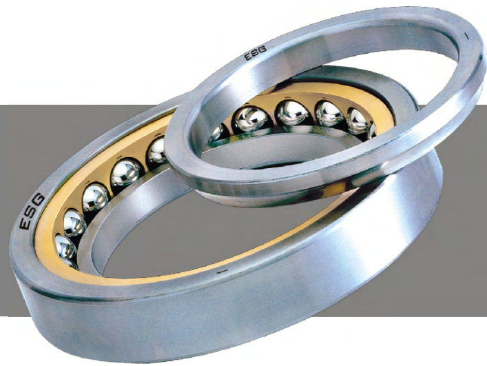
四点接触球轴承 Four-point Contact Ball Bearings