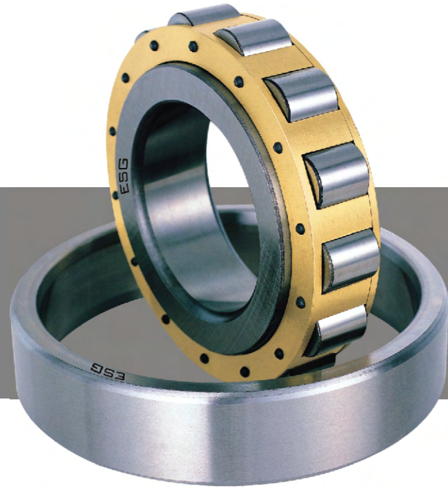
单列圆柱滚子轴承 Single-Row Cylindrical Roller Bearings